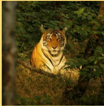
Mahesh Chovatiya, 2018